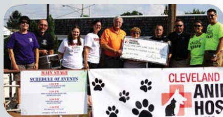
CRAH staff presents check to Wayne County Humane Society

Phone: (330) 345-6063 Fax: (330) 345-9670 www.ClevelandRoadVet.com